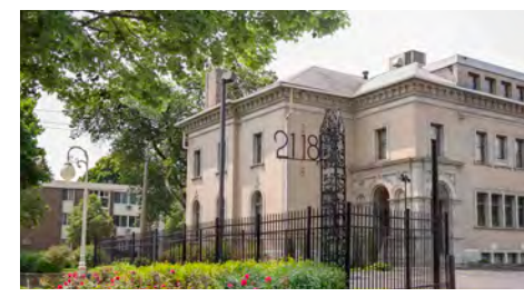
2118 NUWAY Counseling Cente